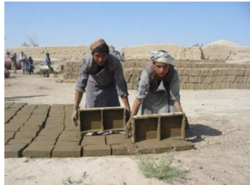
Brick production for shelter program Salbarun, Afghanistan 2002