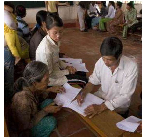
HRC Rach Gia, Vietnam