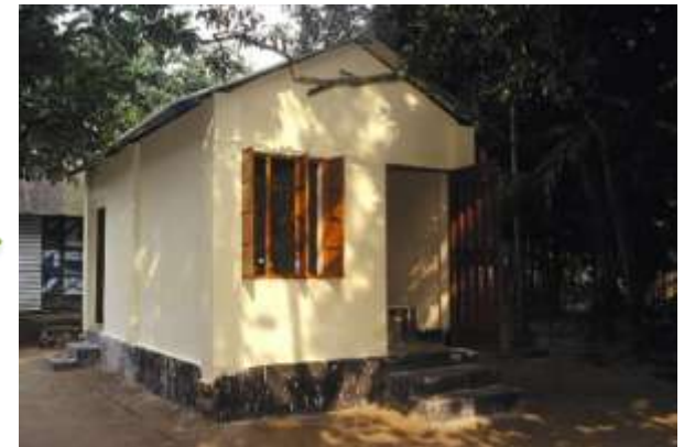
Habitat home, Bangladesh

* Pathways to Permanence is the process of sheltering disaster-affected families using holistic program interventions that enable, support and incrementally progress toward the achievement of permanent, durable shelter solutions, while reducing the vulnerabilities of families and communities