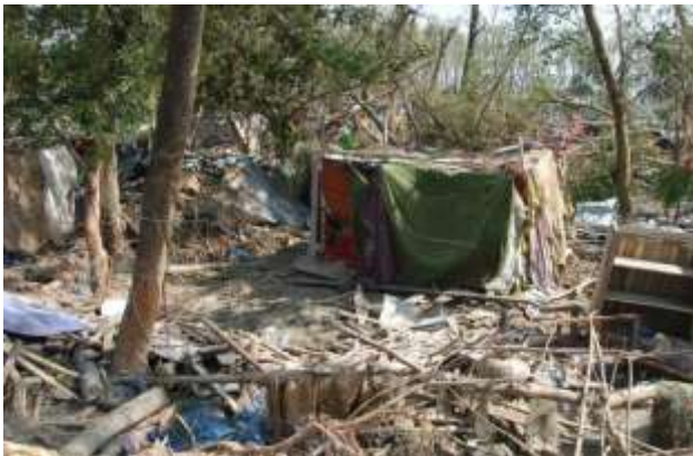
After Cyclone Sidr, Bangladesh 2007