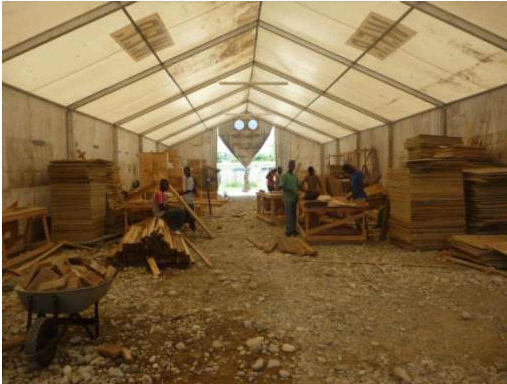
HRC Leogane, Haiti