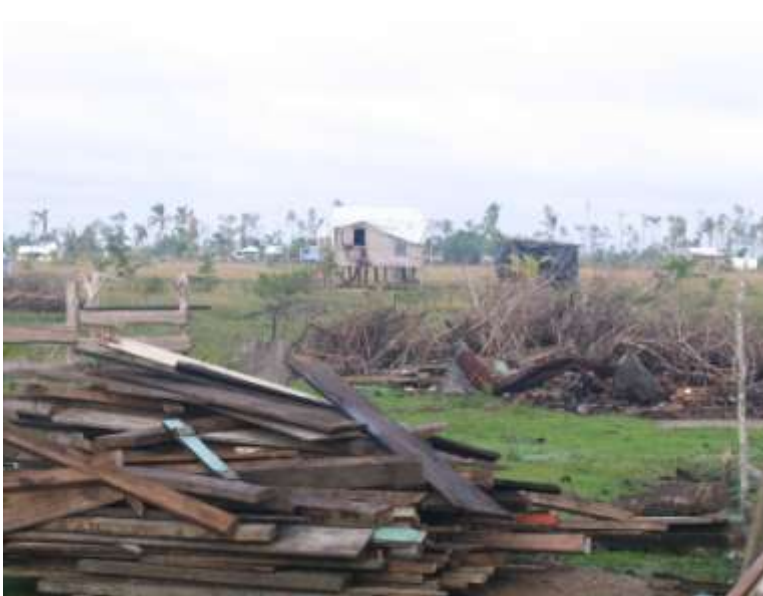
Salvage of wood after Hurricane Felix Auhya Pihni Miskito Community, Nicaragua 2007