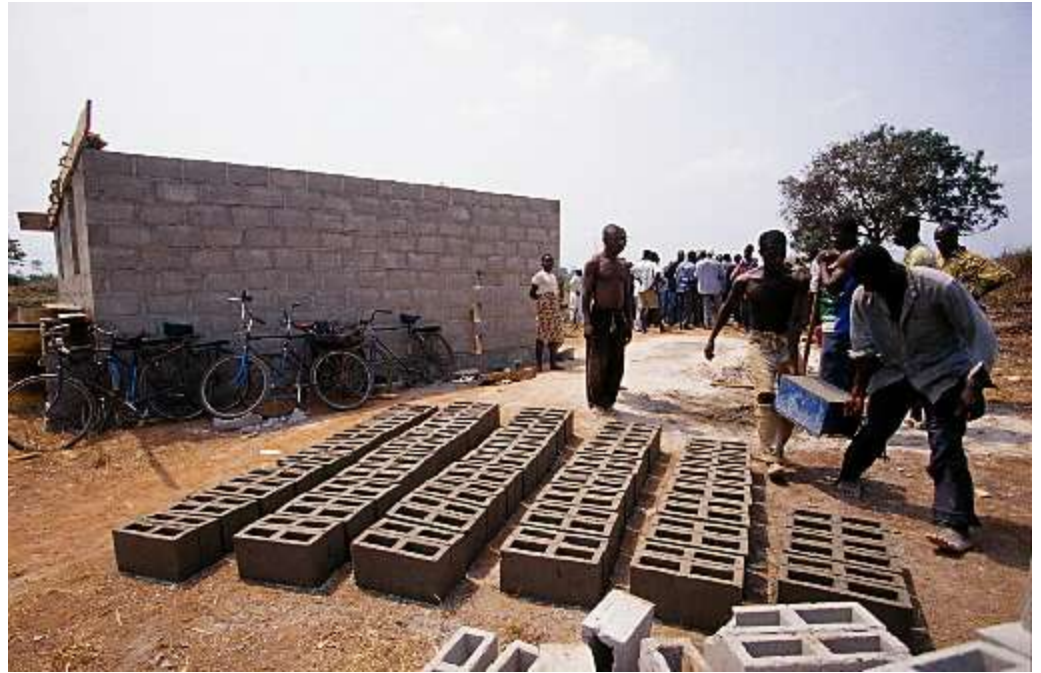
Aboude-Kouassikra, Ivory Coast