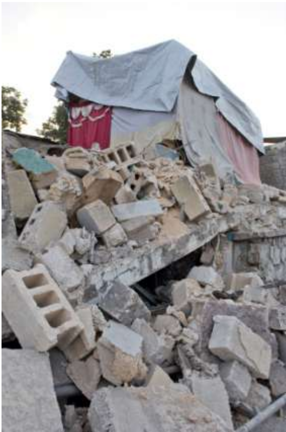
Haiti Earthquake 2010