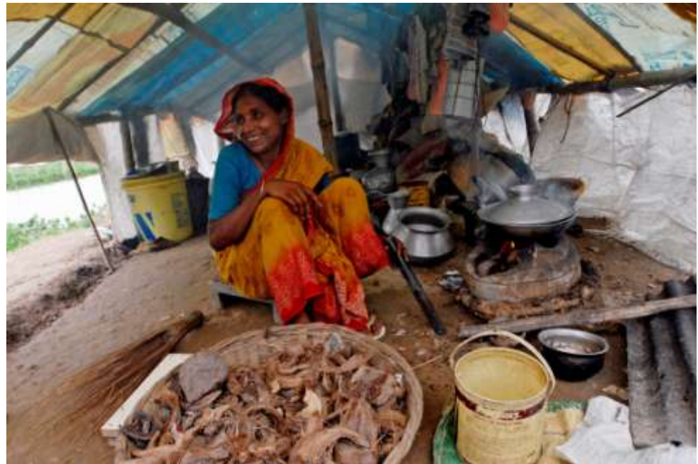
Bangladesh Cyclone Sidr 2007