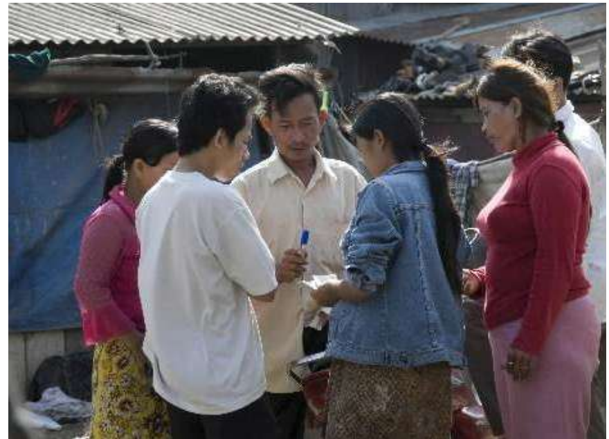
Community leadership at work after Typhoon Ketsana (Vietnam, Cambodia 2009)