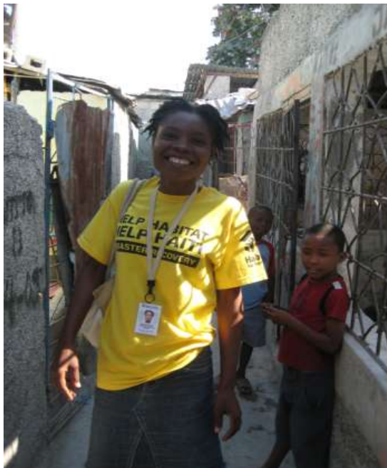
Simon Pele neighborhood, Port-au-Prince, Haiti